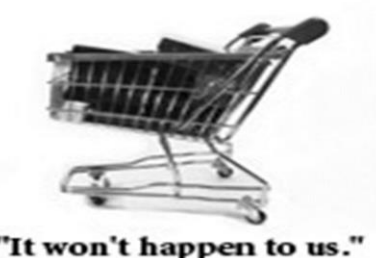
"It won't happen to us." Big box retailers