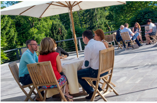
Two weeks of learning are intertwined with socializing activities

in learning and teaching. A very unique feature of IMTA is its closely collaborating faculty, providing complementary and reinforcing insights, as well as demonstration of different teaching styles and techniques.