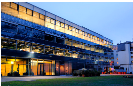
Management Center Innsbruck