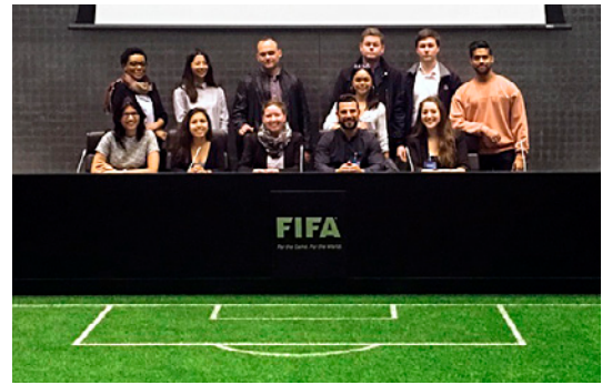
SBS student at FIFA