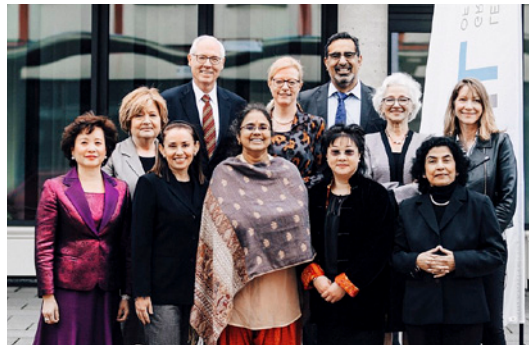
The new International Advisory Board of HHL with 11 members from 10 countries