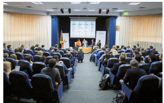
Participants of the Visionary Conference "Humans of the Future" at LvBS

The conference featured presentations by 15 speakers from various Ukrainian cities as well as from Italy, Sweden, Canada, and Great Britain. It brought together over 100 participants. The event consisted of three thematic panel discussions: "Ethics and Technology: Does the Future Need Us?", "Social Entrepreneurship as Business Evolution", and "Startup Planet: From Bold Ideas to Sustainable Business", as well as an interactive tandem on "Cosmic Future: Where Does Ukraine Fit In?"