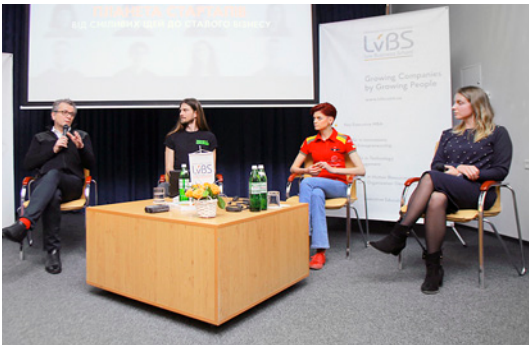
The panel discussion "Startup Planet: From Bold Ideas to Sustainable Business"

Here is a summary of top statements from the conference: