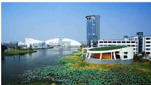
25th CEEMAN Annual Conference Hangzhou, China

"Rethinking Entrepreneurship: Challenges for Management Education in Rising Economies"