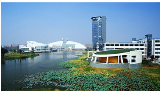
25th CEEMAN Annual Conference Hangzhou, China

"Rethinking Entrepreneurship: Challenges for Management Education in Rising Economies"