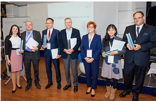
Champions of last year's competition