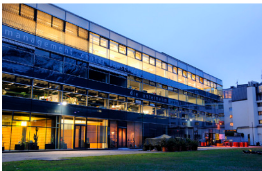
Management Center Innsbruck