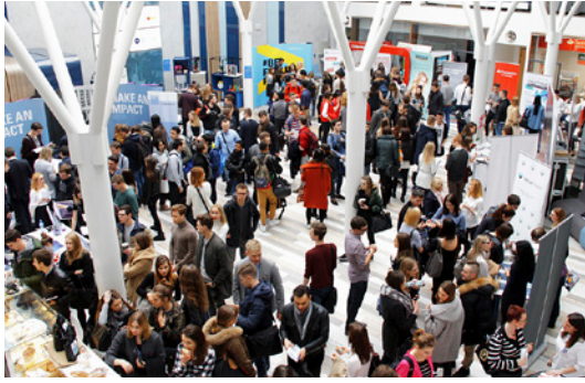
Job fair at Kozminsky University in March 2007