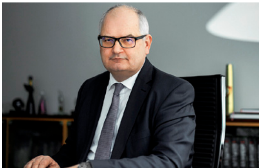
VGTU rector Prof. Alfonsas Daniunas

To compile the QS World University Rankings by Subject 2017 a total of 46 subject areas were evaluated. The screening process covered 4,438 universities, and only 1,117 higher education institutions have been ranked. The criteria for evaluation covered reputation among academics, reputation among employers, and citations. Unlike other rankings, this one does not take into account data provided by universities. Only external data sources and scientific publication databases are used.