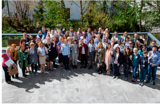
52 Participants enjoyed their three-day Program Management Seminar at Bled

A record number of 51 program managers from 20 countries and 33 institutions attended CEEMAN's Program Management Seminar on 5-7 April, hosted by the IEDC-Bled School of Management.