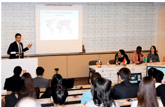
MINT Forum 2017