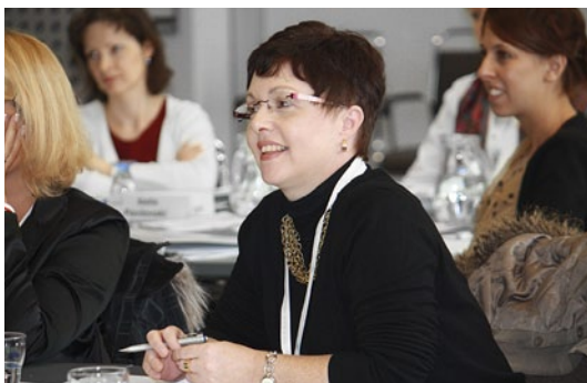
Program Management Seminar generates great interest around the world