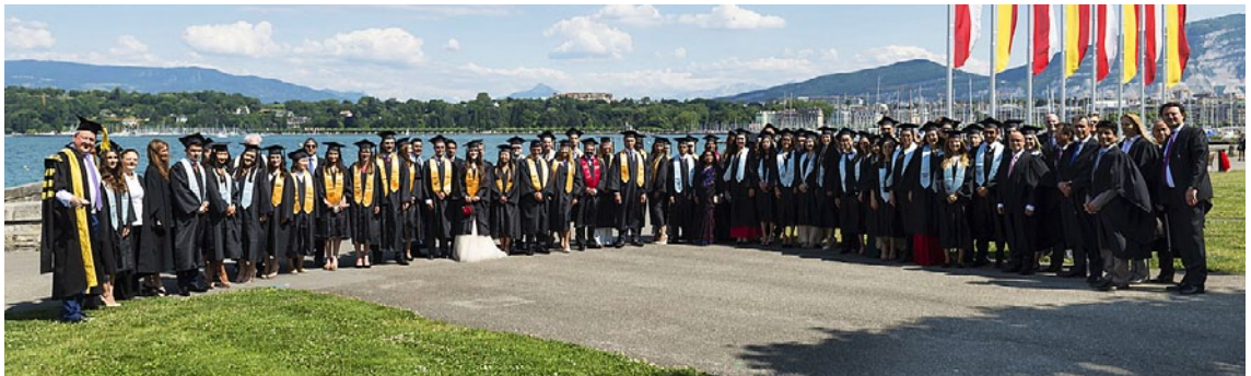
European University Commencement