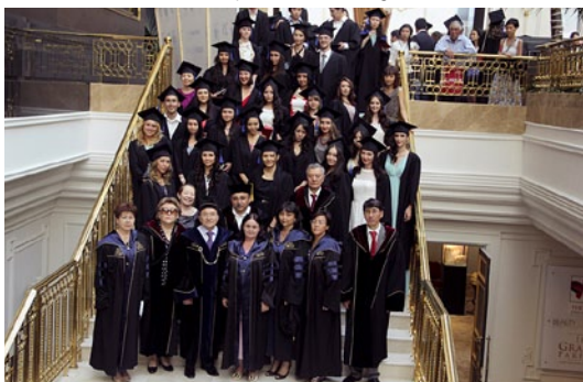
Graduation ceremony 2014 for Undergraduates and Masters

By adding the word "Almaty" to its name, ALMU wants to foster a close link with the city where the university was established in 1988. With this new name, the university appreciates its provenance and pays tribute to the city where it was created.