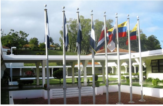
INCAE, conference host and co-organizer