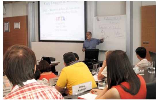
IMTA participants during a session on Case Research & Writing

"Thanks so much ... I had much more fun in Bled than was good for me but most importantly I also learned a lot from you, your colleagues, and my fellow participants. It was wonderful to be welcomed so completely despite having no expertise in business education and I really enjoyed meeting fellow instructors from all over the world. I will always remember my time at IMTA and will definitely be incorporating some of the techniques and approaches I heard about into my own teaching. I wish you the very best in your future