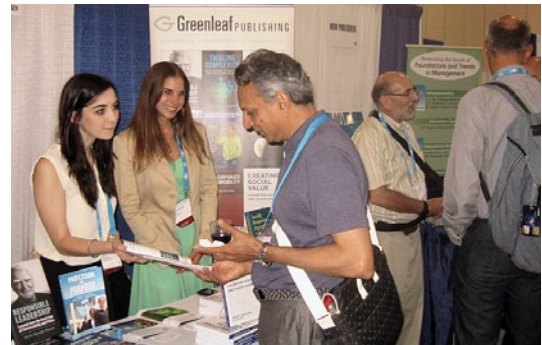
Socially Responsive Organizations and the Challenge of Poverty book promotion in Philadelphia, USA

The second book, 21st Century Management Education and the Challenge of Poverty , which focuses on the question of how to integrate poverty-related issues into management education, is in progress and will be ready for publishing in the fall of 2015. It will be presented at the Fourth Global Forum for PRME in New York and the 23rd CEEMAN Annual Conference, both in September 2015, as well as at an international conference on poverty and management education that will be held in Milan, Italy at the occasion of EXPO 2015.