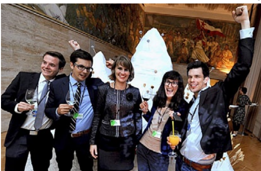
IEDC YBSF celebrating

Apart from sharing the prize of €2,500, the winning team had the opportunity to present its solution to businessmen, ministers, and other participants of BSF, on Tuesday, September 2, 2014. Congratulations to the winners!