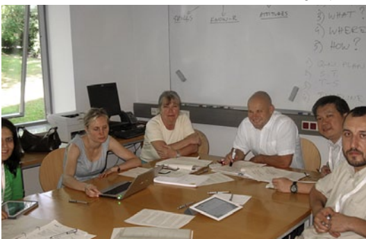
IMTA 2014 group work

IMTA alumni also continue receiving various forms of post-program support and access to IMTA related programs, such as the IMTA Module on Case Writing, the IMTA Module on Research and Publishing, various programs on developing consultancy, administration and institution building skills, etc.