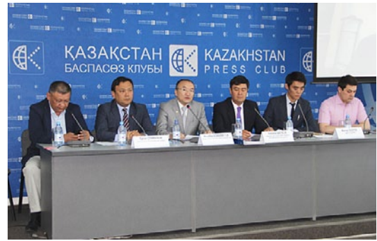
Opening of School of Law at ALMU University

The President of ALMU says that focusing on innovative management will also help the university become the principal engine driving growth in the Eurasian Economic Union (a treaty between Belarus, Kazakhstan, and Russia). Innovative management will be based on the operations of