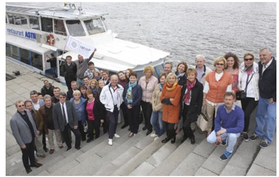
IMISP team. Corporate trip on the Baltic Gulf (June, 2014)

The International Management Institute of St. Petersburg (IMISP) celebrates its 25th anniversary.