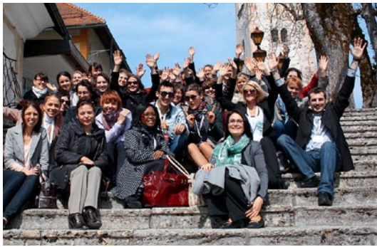
Seminar participants visiting Bled Island